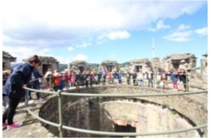
Year 4 visited Conway Castle during their topic about Edward 1 and Owain Glyndwr.