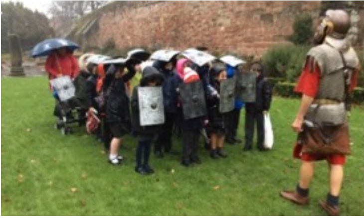
Year 3 visited Chester to learn about Roman life.

Our children go on a variety of school trips linked to their history topics. We want our children to be excited about the topics they learn about and to experience what life was like for people who lived in the past.