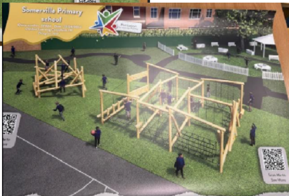
Key Stage 2