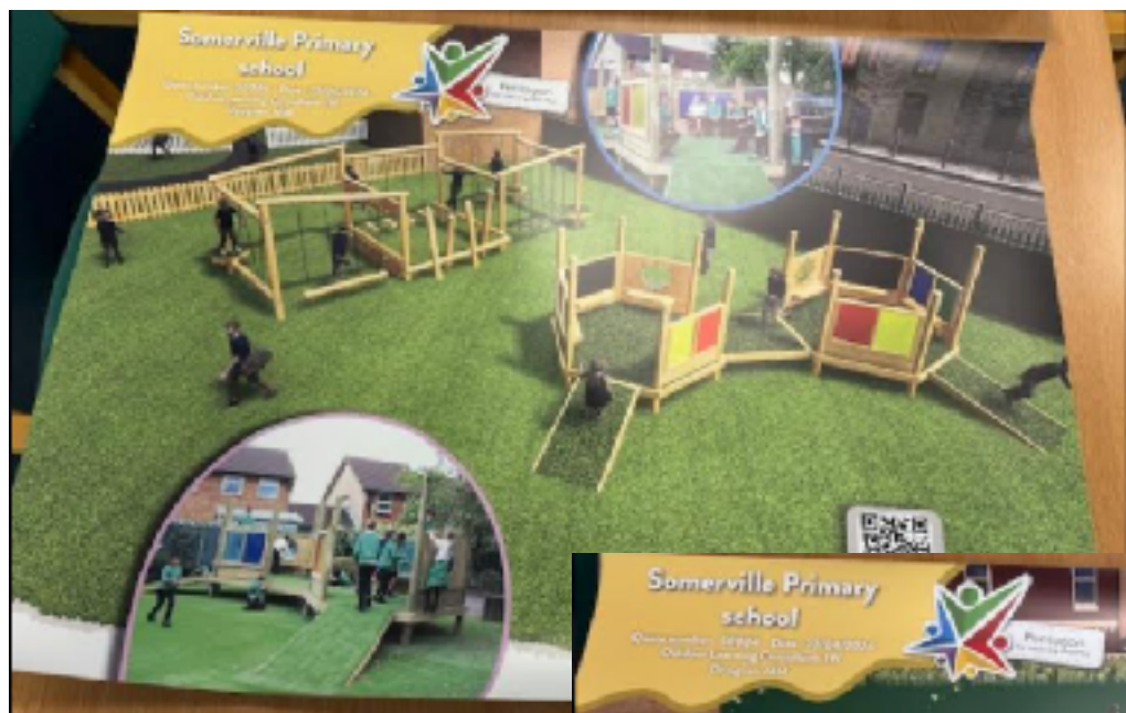
Key Stage 1

We are investing heavily in this project so our children can really enjoy break times and lunchtimes. There will also be quiet spaces available outside for those who get overwhelmed. Please see some pictures of the designs below. Work will start in the summer holidays.